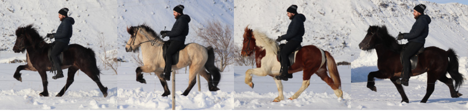
We believe in and have high expectations for the future.